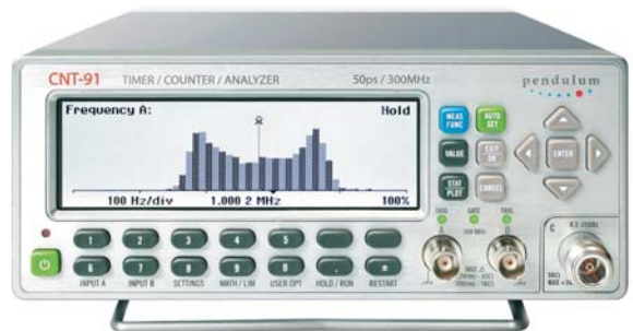
Figure 6: The same result as in figure 5, now displayed as a histogram.