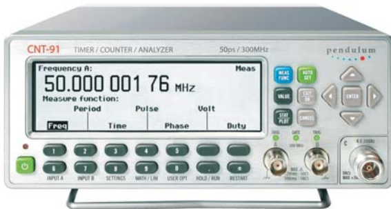
Figure 2: Measure function selection menu, shown with measured results.