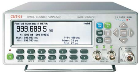
Figure 4: Display showing different statistical parameters viewed at the same time.