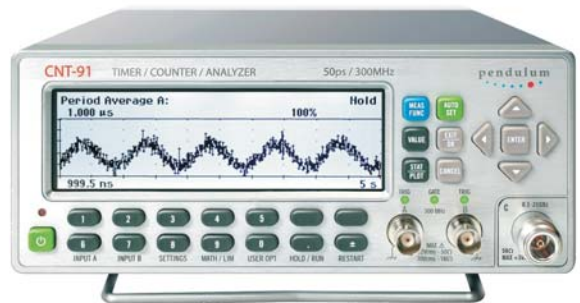
Figure 5: Display showing the trend (signal over time) of sampled data.