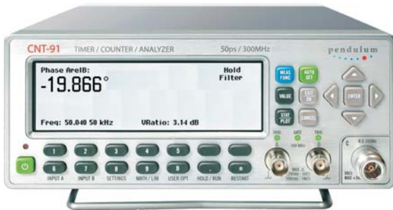
Figure 1: Display showing phase value, frequency, attenuation V_A/V_B , and auxiliary parameters.

When adjusting a frequency source to given limits, the graphic display gives fast and accurate visual calibration guidance.