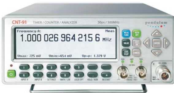
Figure 3: Input parameter setting menu shown with measured result.